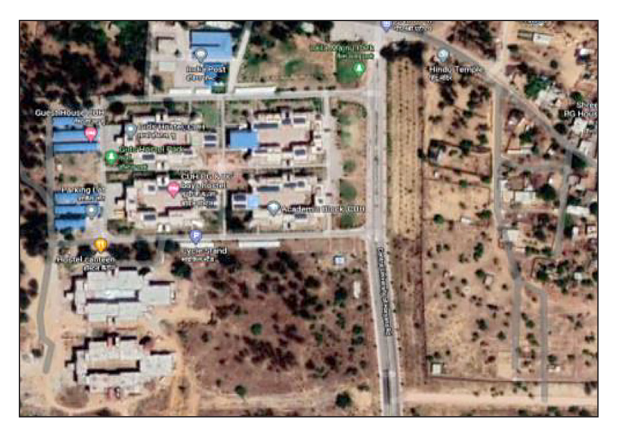
Figure 1. Study area of CUH campus

The district shows the complete sequence of the Delhi and the pre-Cambridge expansion of the Aravalli ranges, composed of quartzite, shales, phyllites, schists, etc., with different firearms. It is gradually leveled to separate alluvial and sandy plains, surrounded by sand dunes, isolated hills and ridges. The soil throughout the profile is mostly sand to loamy sand. The subject area is in the Indo-Gangetic alluvium from the Upper Pleistocene to the recent. Older alluvium consists mainly of inter-bedded litular and interbedded beds of clay, sand, gravel and silt interspersed with calcareous nodules. The new alluvium consists mainly of laticular beds of clay, sand and occasionally gravel (CGWB, 1998). A typical bore log data of the CUH campus is shown in Table 1. The soil layer below the top lens is an alluvial deposit in the form of a clay lens. These lenses are not inter-connected and therefore form a leaky